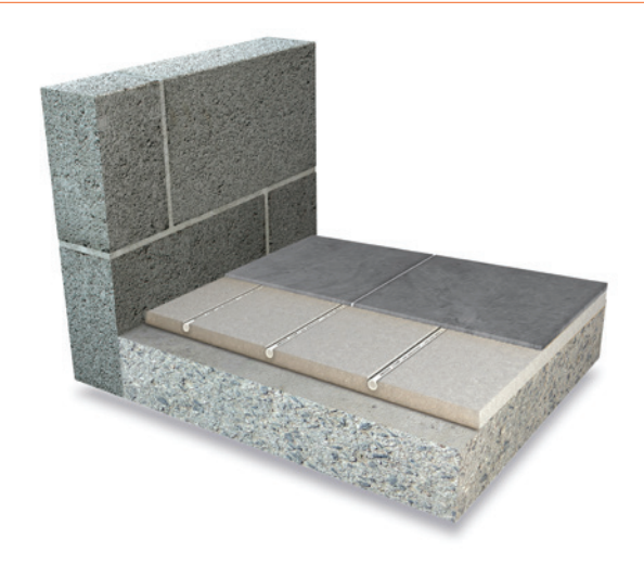
AmbiLowboard (SRB) SX and RX boards