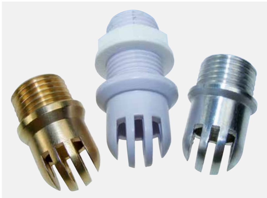
Thimble sensors in stainless steel, brass and white plastic