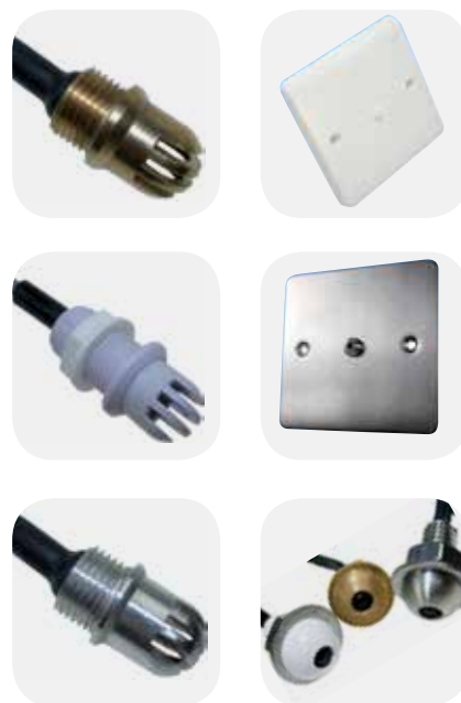
Button sensor options